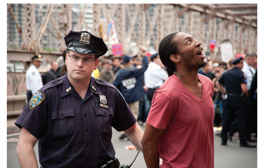
UNAFRAID: Despite 700+ arrests on the Brooklyn Bridge on Oct. 1, crowds surged in the following days.