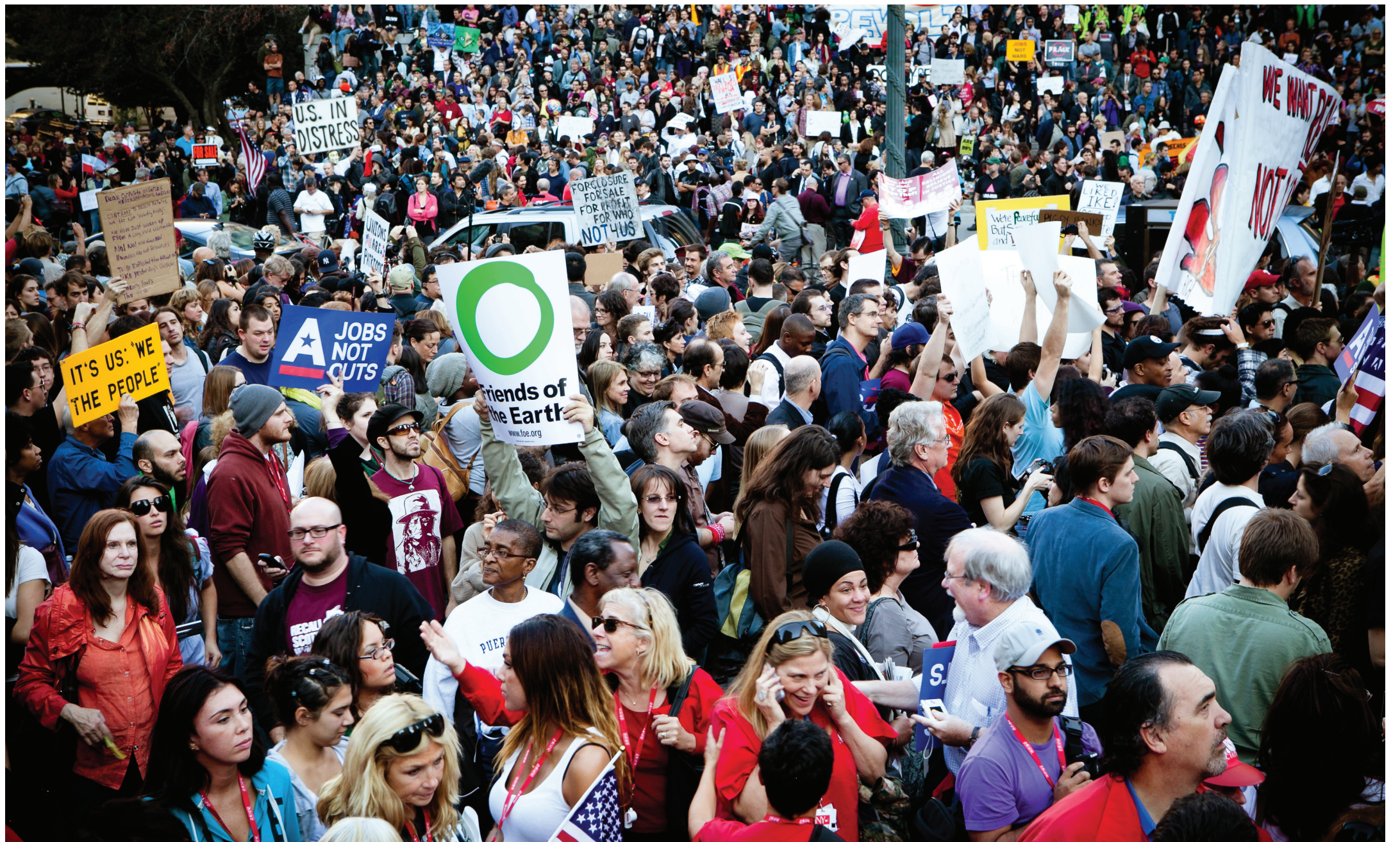
NEW YORK TURNS OUT TO OCCUPY WALL STREET: Labor unions and student walkouts brought tens of thousands to Foley Square on Oct. 5. After dusk, crowds filled lower Manhattan around Zuccotti Park, re-named Liberty Square by the occupation. Despite high spirits among the protesters and no incidents of violence or vandalism, NYPD officers arrested numerous people. Pepper spray and batons were also deployed.

The point is, today everyone can see that the system is deeply unjust and careening out of control. Unfettered greed has trashed the global economy. And it is trashing the natural world as well. We are overfishing our oceans, polluting our water with fracking and deepwater drilling, turning to the dirtiest forms