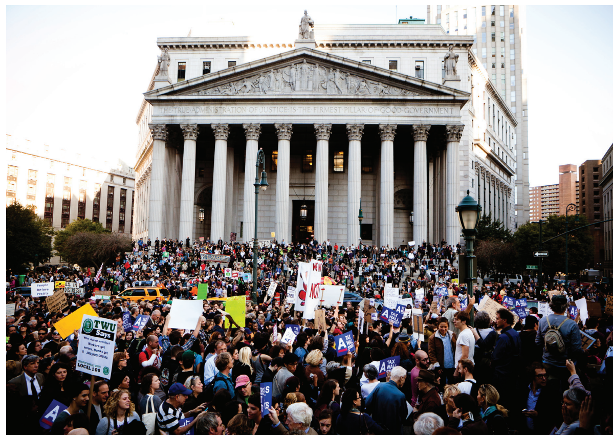
FOLEY SQUARE, OCT. 5.

"The United Steelworkers union, North America's largest industrial union with 1.2 million active and retired members, stands in solidarity with and strongly supports Occupy Wall Street. The brave men and women, many of them young people without jobs, who have been demonstrating around-the-clock for three weeks in New York City, are speaking out for the many in our world. We are fed up with the corporate greed, corruption and arrogance that have inflicted pain on far too many for far too long. Our union has been standing up and fighting these captains of finance who promote Wall Street over Main Street. We know firsthand the devastation caused by a global economy where workers, their families, the environment and our futures are sacrificed so that a privileged few can make more money on everyone's labor but their own."